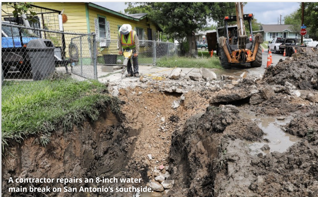
A contractor repairs an 8-inch water main break on San Antonio's southside.