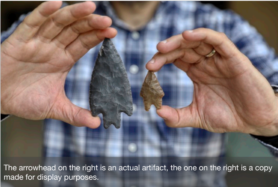
The arrowhead on the left is an actual artifact, the one on the right is a copy made for display purposes.

types of tools and animal remains which have been unearthed through careful excavations that show large groups of people inhabiting the Headwaters site. Then there is the City of New Braunfels' first municipal water well and utility buildings dating back to the 1930s located on the property to be accounted for.